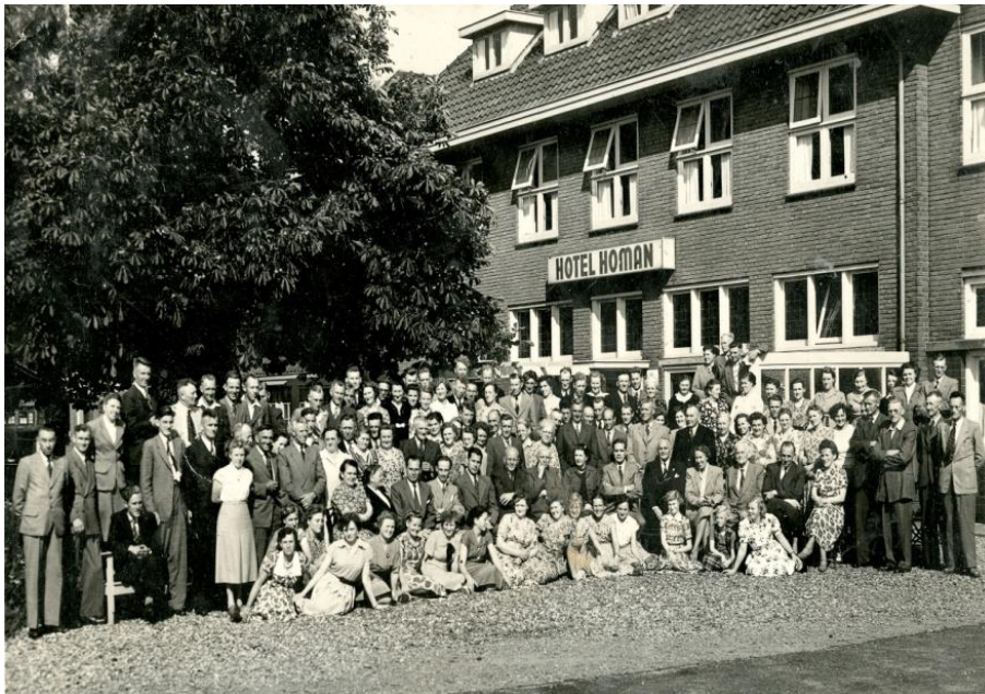
Immigrants of Castrolanda posing in front of hotel Homan, Hoogeveen 1952

Together with the local volunteers a very practical approach will be chosen, and decided how the digitization will be done, using international standards. In case no proper equipment or tools are present, these will be provided for in the workshop.