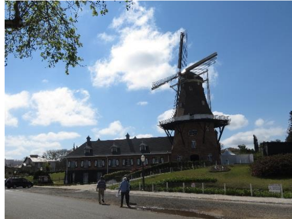
Dutch windmill at Castrolanda, Brazil

Apart from these museums there is the Associação Cultural Brasil-Holanda (ACBH), an organization of Dutch and Dutch-Brazilians, which has the intention to preserve Dutch heritage in Brazil. The ACBH, which was established in 1998 by economic, cultural and religious organizations in the group settlements of Paraná, issues the bilingual magazine Regenboog/Arco Iris with news from and about the Dutch group settlements in Brazil. The association also manages a small documentation center with books on the Dutch migration to Brazil and the group settlements.