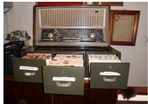
Examples of storage conditions at the heritage center of Holambra